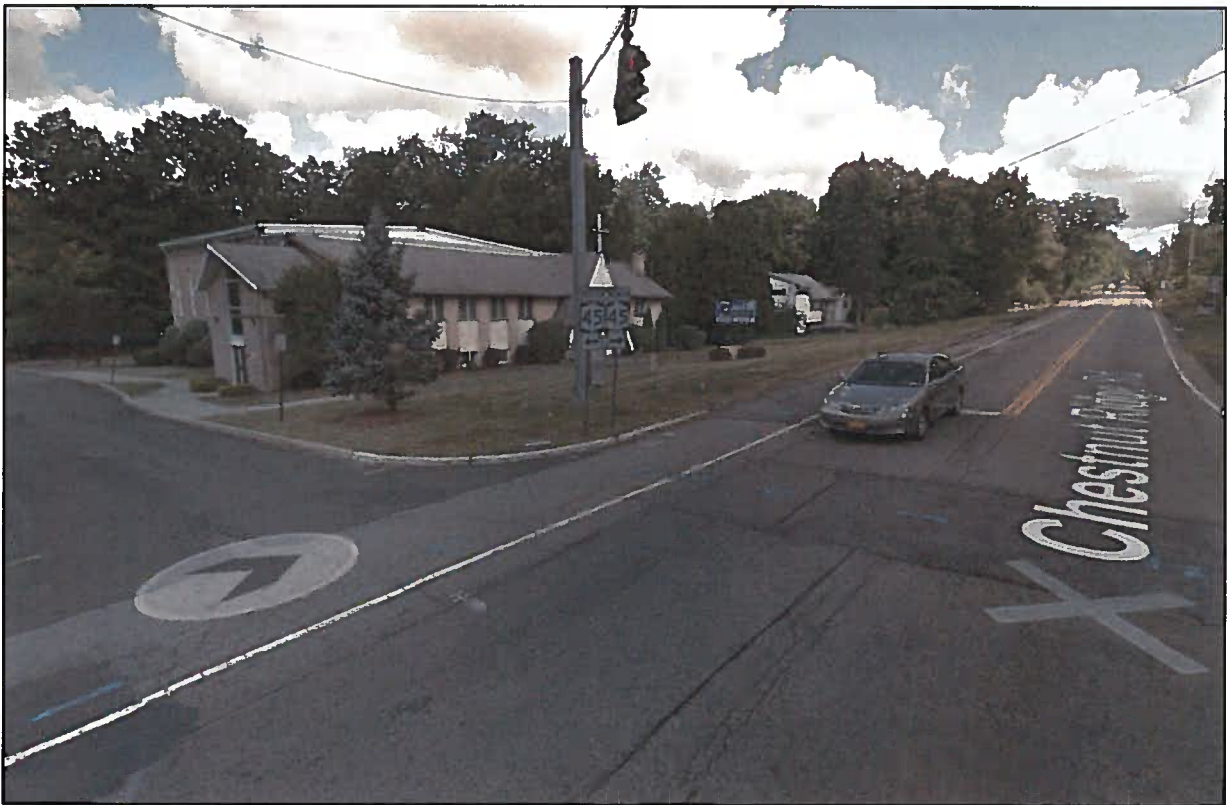
Above: Illustrative example of how the introduction of a non-residential public assembly use in a residential area adversely affects neighborhood character and increases parking demand and traffic generation.